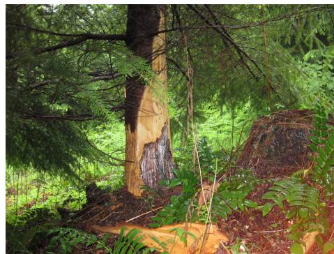
Multiple year spring black bear damage on 20 year old Douglas-fir.