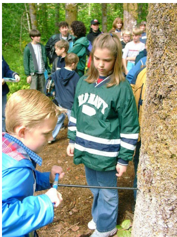
Student measures tree age

Project Learning Tree (PLT), a nationwide award winning program developed by the American Forest Foundation (AFF) has been sponsored by WFPA for over 30 years in Washington. It remains WFPA's premier teacher education program. Teachers incorporate PLT into their curriculum and receive strategies for successful field studies in forests. This year, the PLT program expanded its reach by 25% resulting in: