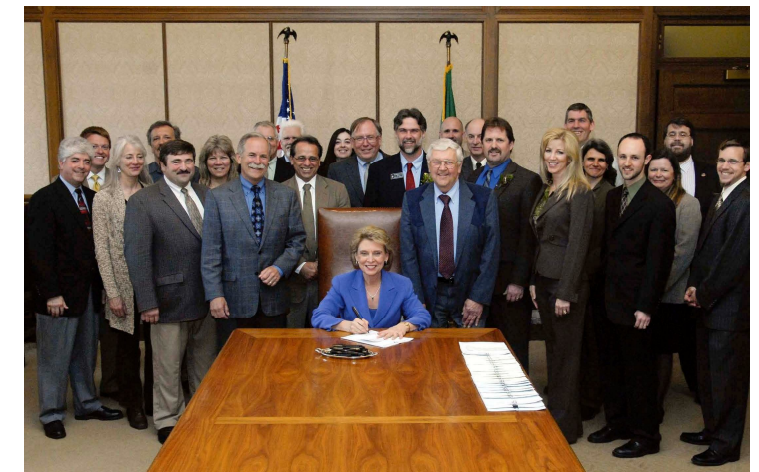
SB 5401 Habitat Open Space Purchase Program

Right to Forestry law, which clarifies that forest practices include growing of timber.