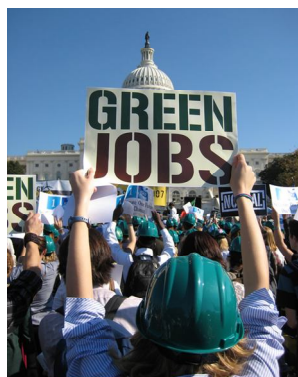
STEM readies students for 21st Century jobs.

Coastal Education Program with NOAA. Working with Governor Gregoire's Office and with the support of a National Oceanic and Atmospheric Administration grant, WFPA, PEI and the Department of Fish and Wildlife developed a Coastal Watershed Education Model. By partnering with five school districts along the coast and the Grays Harbor College, senior high school students